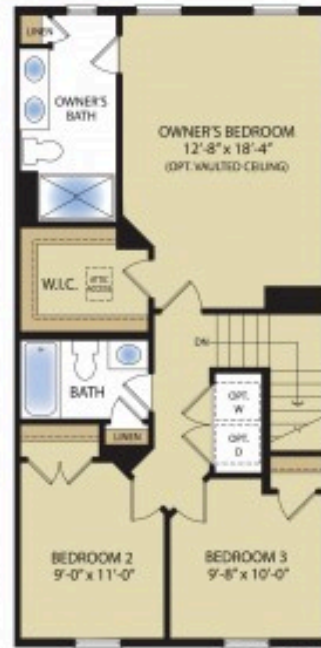
40' SECOND FLOOR